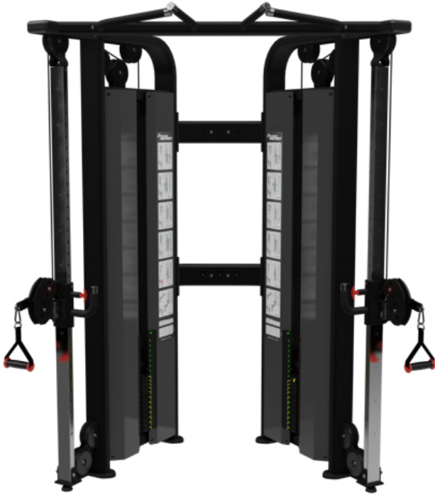
FRAME SHOWN IN -60°

Instinct® dual motion strength products offer the option of the revolutionary Lock N Load® pinless system. The versatility of Instinct's small footprints also lets you get the most from minimal space, while blending seamlessly with our cardio line for a cohesive facility look.